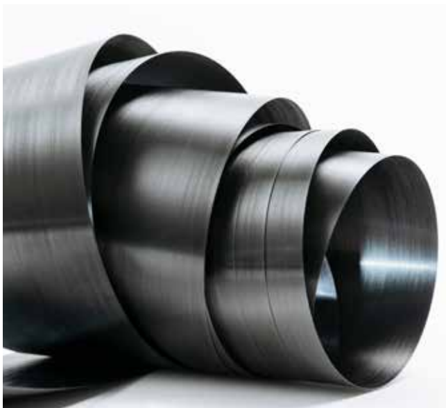
Unidirectional continuous fiber reinforced thermoplastic tape (UD tape).

Digital twins of individual machines and systems already lead to significant increases in efficiency in industrial production and continuous operation, e.g. through improved production control and machine maintenance. However, their potential for value-added and material-triggered process control is still largely untapped. This applies in particular to the increasing series production of plastic-based composite lightweight structures.